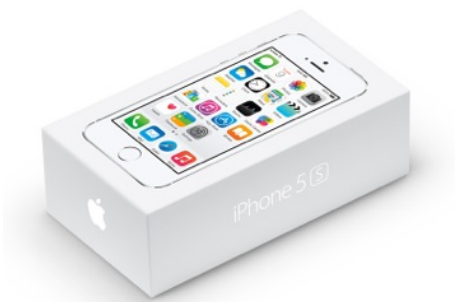
U.S. retail packaging of iPhone 5s is 26 percent lighter and consumes 41 percent less volume than the first-generation iPhone packaging.

The packaging for iPhone 5s is highly recyclable, and its retail box is made primarily from bio-based materials, including fiberboard containing 90 percent post-consumer recycled content. In addition, the iPhone 5s packaging is extremely material efficient, allowing 80 percent more units to be transported in an airline shipping container compared to the first-generation iPhone. The following table details the materials used in iPhone 5s packaging.