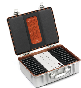
Bretford PowerSync Case for iPod

To learn more about Apple mobile learning solutions, visit www.apple.com/education/labs or call 1-800-800-2775 to speak with an Apple education representative.