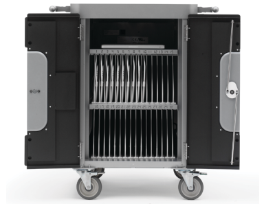
Apple iPad Learning Lab with 10 iPad devices