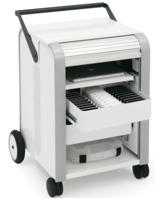
Apple iPod Learning Lab with 20 iPod touch devices