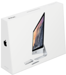
The 27-inch iMac with Retina 5K display retail packaging consumes 37 percent less volume and weighs 19 percent less than the original 15-inch iMac packaging.

The 27-inch iMac with Retina 5K display stand is made with 30 percent recycled aluminum, and speaker enclosures are made with 30 percent post-consumer recycled plastic.