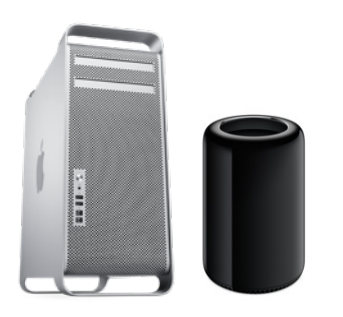
Mac Pro is extremely material efficient, consuming 74 percent less aluminum and steel compared with the previousgeneration Mac Pro.