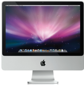
Model MB323, MB324 (20-inch iMac)