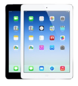
Date introduced October 22, 2013