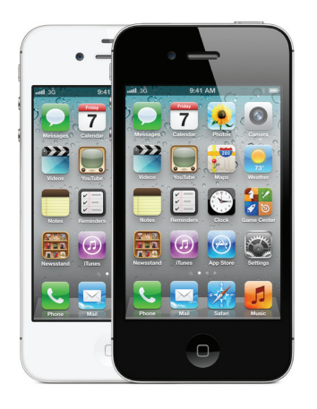
Date introduced October 4, 2011