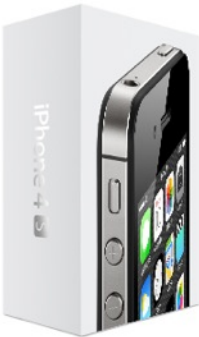
U.S. retail packaging of iPhone 4s is 35 percent lighter and consumes 46 percent less volume than the first-generation iPhone packaging.

Apple’s ultracompact product and packaging designs lead the industry in material efficiency. Reducing the material footprint of a product helps maximize shipping efficiency. It also helps reduce the energy consumed during production and material waste generated at the end of the product’s life. The chart below details the materials used in iPhone 4s.