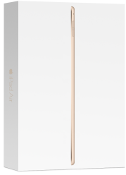
iPad Air 2 retail packaging uses a minimum of 38 percent post-consumer recycled content.