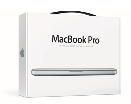
The 13-inch MacBook Pro retail packaging consumes 41 percent less volume than the original MacBook. Its retail and shipping packaging contain three times as much post-consumer recycled content as the original 13-inch MacBook Pro.

System battery: lithium-ion polymer, 63.5 Whr Free of lead, cadmium, and mercury