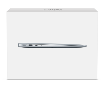
The 13-inch MacBook Air packaging is extremely material efficient, allowing at least 15 percent more units to fit in each shipping container than the original MacBook Air.