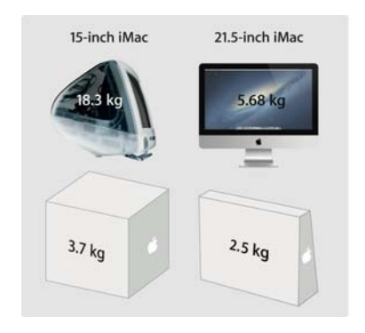
The 21.5-inch iMac retail packaging consumes 56 percent less volume and weighs 32 percent less than the original 15-inch iMac packaging.