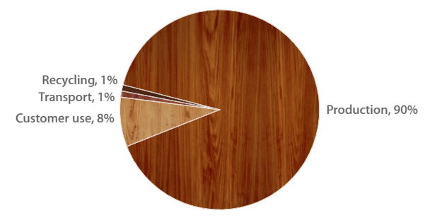
Total greenhouse gas emissions: 530 kg CO2e