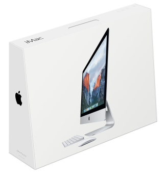
The 21.5-inch iMac retail packaging consumes 53 percent less volume and weighs 35 percent less than the original 15-inch iMac packaging.